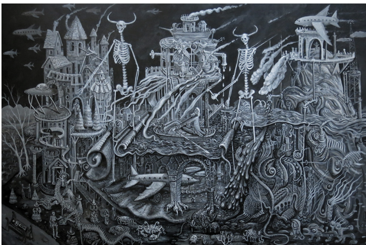
"Battle Of The Seas" 2015 Acrylic on Canvas 40 x 60 inches